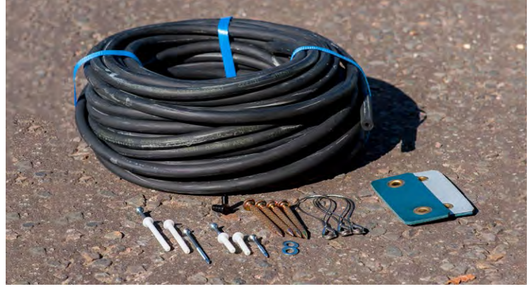
Accessories included in the RoadPod® VT field kit.