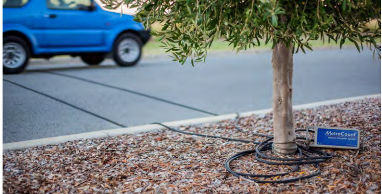
Portable counters are easy to setup and relocate.