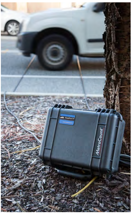
MetroCount supports a range of enclosure options enabling remote access in a variety of RoadPod® VT applications.